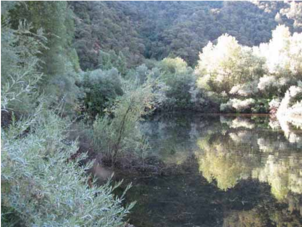
Horseshoe Bar Pond E