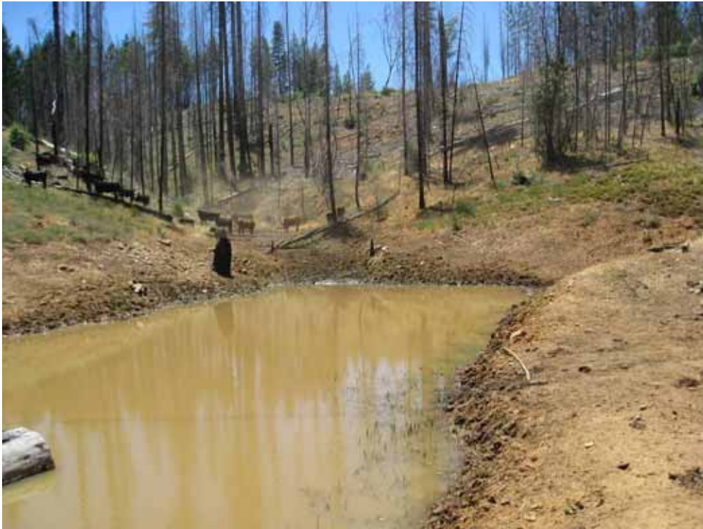
Ralston Ridge Pond