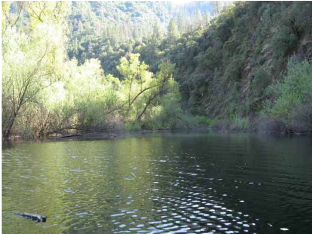
Horseshoe Bar Pond C