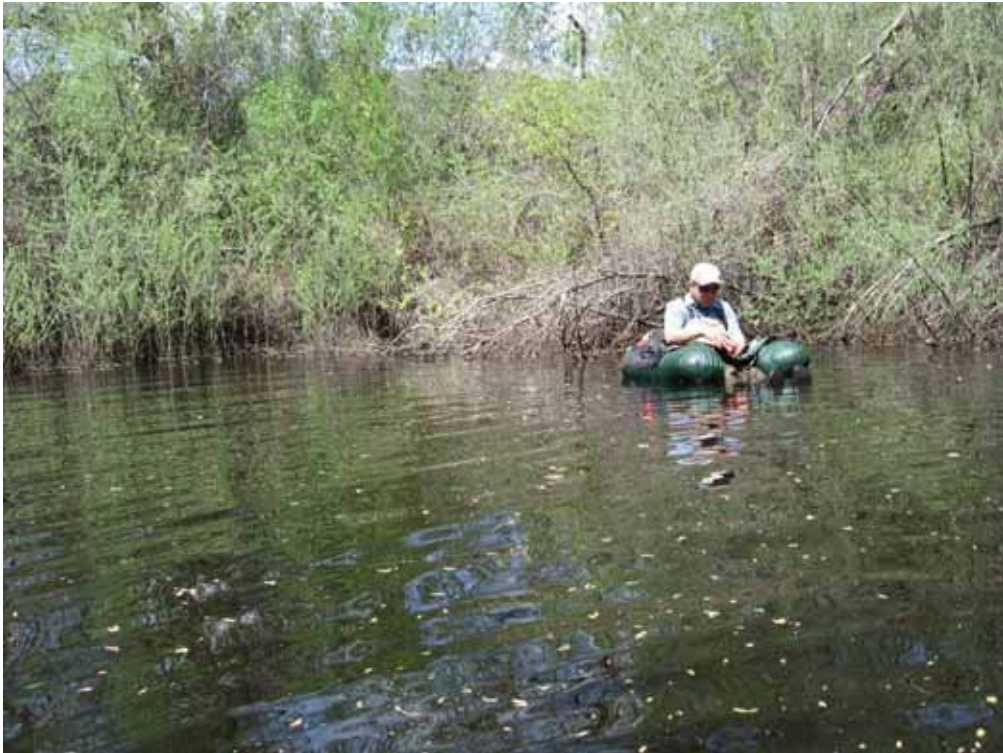
Horseshoe Bar Pond F