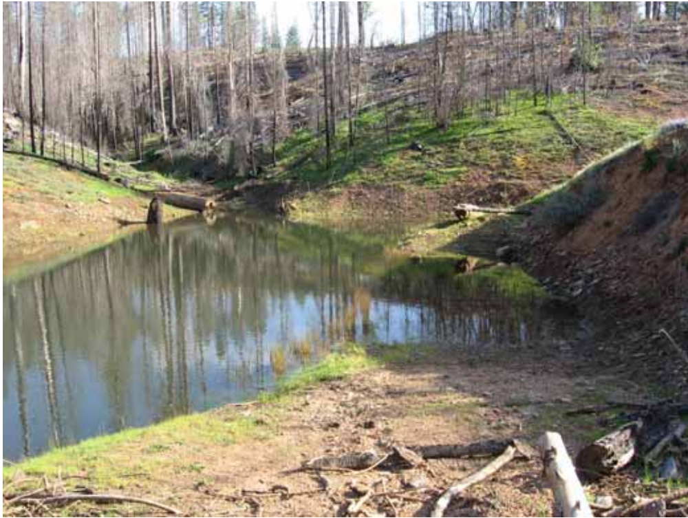
Ralston Ridge Pond